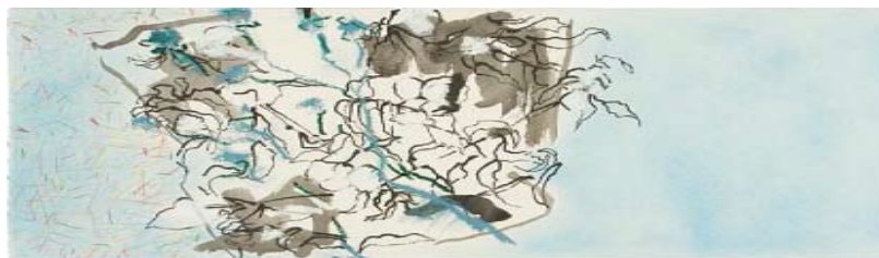
Rodney Konopaki and Rhonda Neufeld, untitled, multi-media on paper, 2010

In these early ventures, we were specifically interested in the place where our two practices intersect and a new creator for the work steps forward. Our working strategy was to proceed through discussion and intuition to find a mode of expression that is new to each of us."